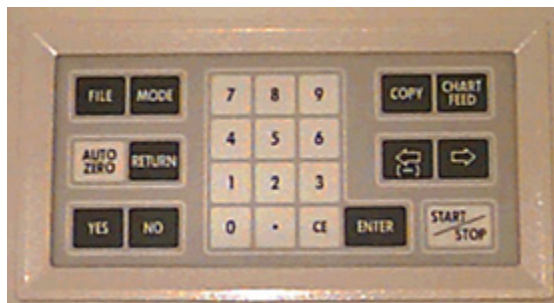
Figure 2: Spectrophotometer Control Panel

Note: Light source runs from the right to the left through the sample in the cuvette chamber.